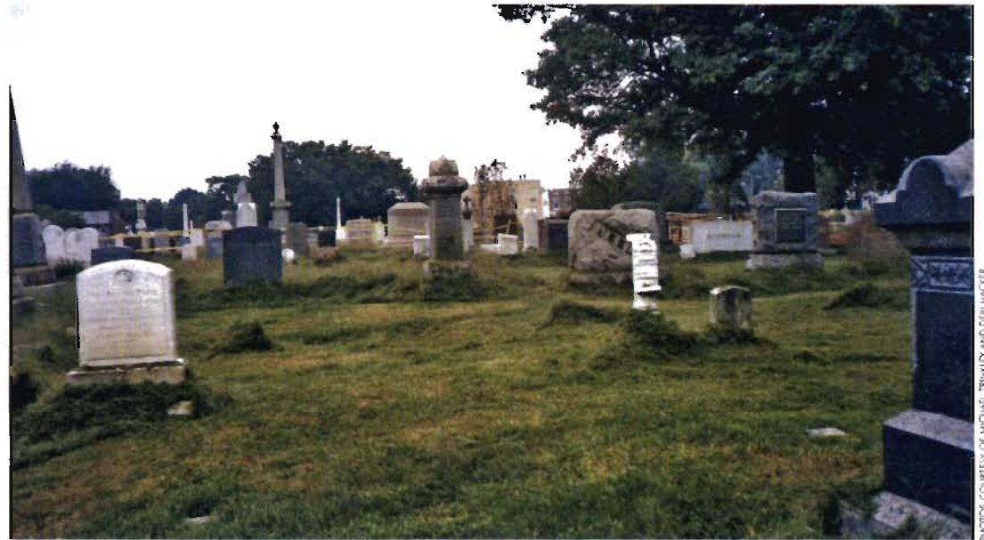
When grass is allowed to grow tall and then closely mowed, as in this case, additional stress is placed on the grass as it attempts to recover.

Other cemeteries, however, are aware of their ethical, social and preservation responsibilities and are attempting to find procedures and approaches to keep the landscape alive, if not green.