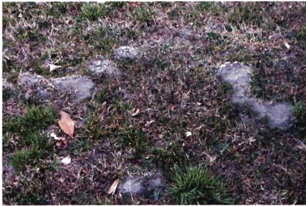
This close-up of a cemetery lawn shows that the grass has already gone dormant, leaving the weeds both green and growing.

this reduces the potential to introduce technologies that could offer significant preservation benefits. When examining costs of making technological changes, cemetery custodians should look at life cycle costs, not solely on up-front costs.