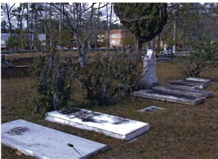
Even shrubbery can succumb to drought. Intervention is necessary to prevent the need for costly replacements. None of these shrubs were appropriately mulched.