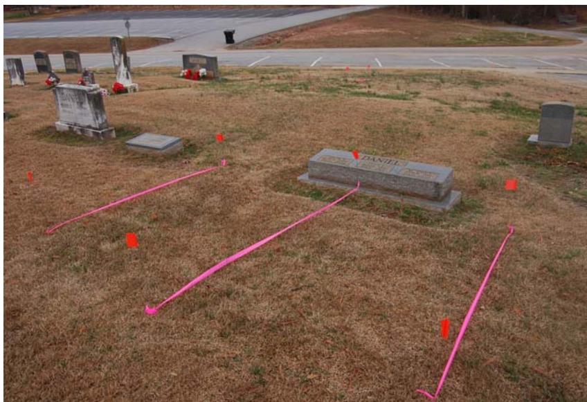
Figure 7. View of cemetery showing graves (marked with flags and flagging tape) identified by the penetrometer study.

probable graves. A total of 134 probable graves were marked during this assessment. Most occur as one, two, or three graves mixed among marked graves. Some appear to represent children, based on their size, and many children's graves went unmarked historically.