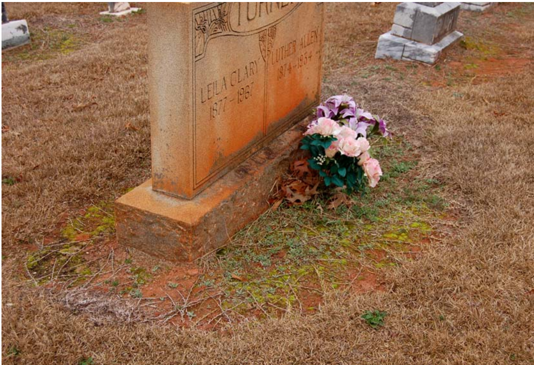
Figure 8. Lawn maintenance problems. The top photo shows mower damage to a flush monument. The lower photo shows the results of herbicide use: increased weeds, disfigured landscape, and much splash back of clay from erosion.