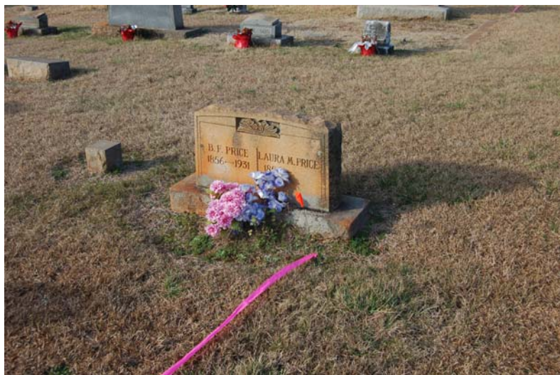
Figure 6. Although the stone has no death date engraved, the penetrometer study confirmed a burial.

The number of unmarked graves in the rear quarter of the cemetery – which is also the most recent section – is also very low. It is also unlikely that any graves would be missed in this area since most of those we checked evidenced the use of vaults.