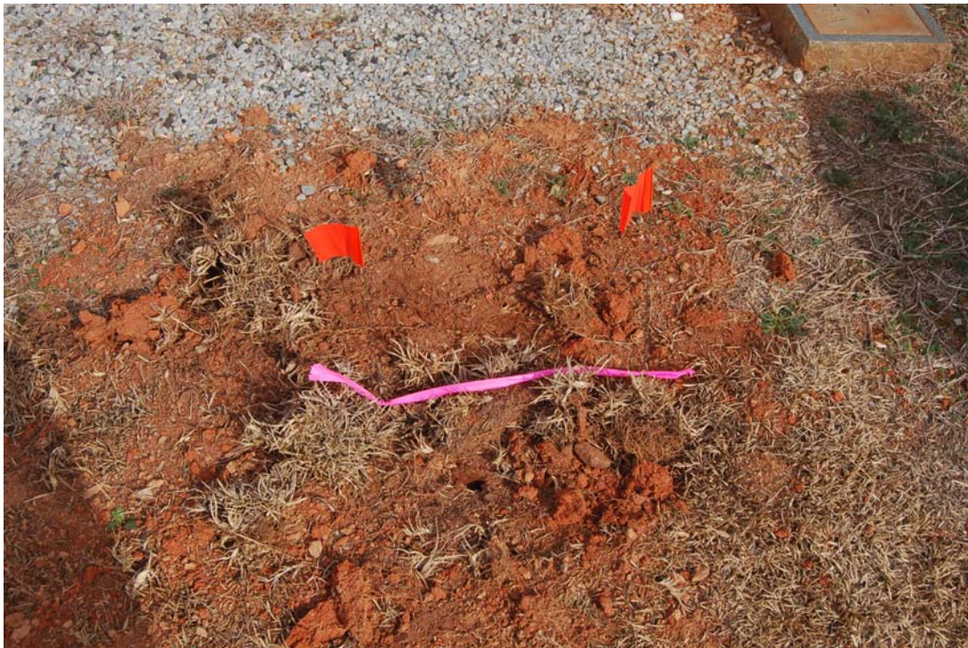
Figure 11. The top photo shows one plot built over another. The lower shows remains placed in the cemetery without the knowledge of the church.