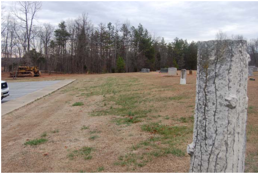
Figure 5. Area on the northwest edge of the cemetery showing grading and an absence of graves.

levels (200 psi and higher) in this area are consistent with clay subsoils, perhaps with additional compaction through the use of heavy equipment. Not only were we not able to identify any areas of lower compaction that might represent graves, but the removal of 1-2 feet of soil would almost certainly have revealed coffin outlines. Thus it is highly unlikely that graves are found in these areas.