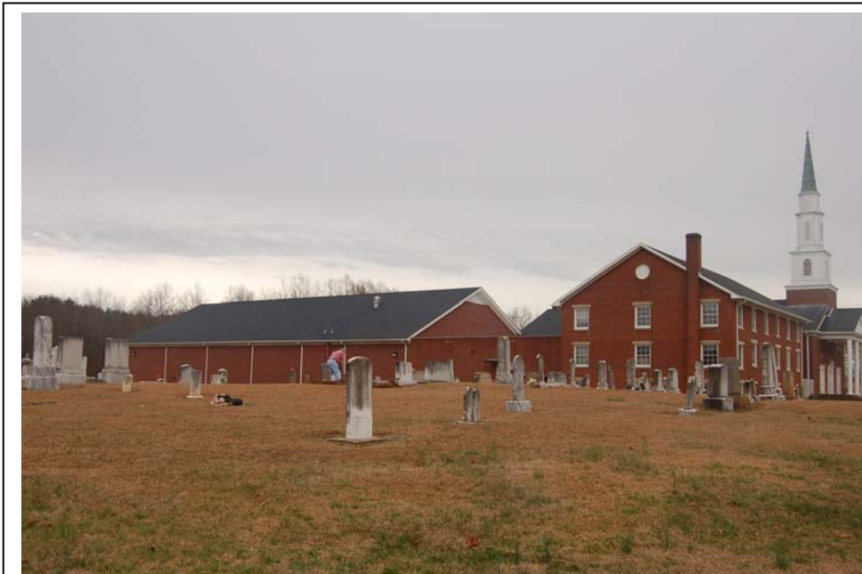
Figure 3. View of the church buildings and cemetery, looking south from the parking area.

ensuring that the soil has the proper amount of moisture. If too much is present, some will be expelled and in the extreme, the soils become soupy or like quicksand and compaction is not possible. If too little is present, there will not be adequate lubrication of the soil particles and, again, compaction is impossible. For each soil type and condition, there is an optimum level to allow compaction.