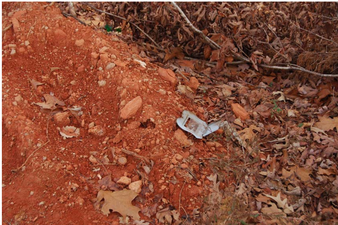
Figure 10. Spoil piles at the edge of the cemetery. In one we identified the remains of a funeral home plate that had been removed with the spoil - effectively losing this burial information.