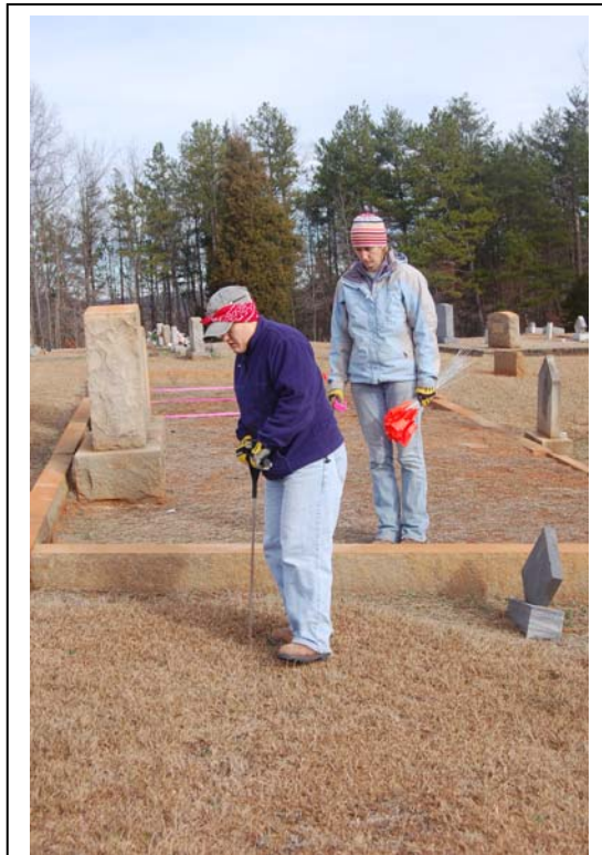
Figure 4. Conducting the penetrometer survey. In the background are three unmarked graves identified by the study that have been flagged.

sections through cultivated fields, old (fallow) fields, woods, roads, bulldozed areas, and cemetery areas (Trinkley and Hacker 1997a:Figure 10). Particularly important were the location of graves made obvious by either monuments or sunken grave shafts.