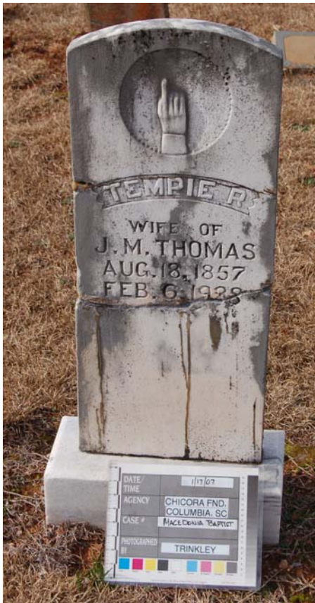
Figure 12. Example of unacceptably repaired stone. The stone is poorly matched on the sides and there is much epoxy left dribbling down the face of the marker.

We understand that (at times) burials are