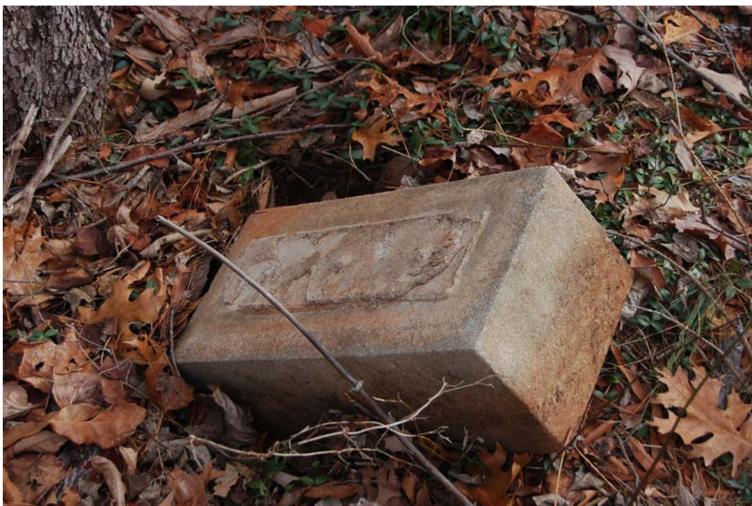
Figure 9. Markers discarded in the woods around the edge of the cemetery. This practice must cease immediately and these stones replaced in the cemetery.