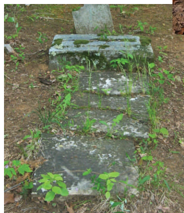
Henry Howser's 1842 stone before treatment.

After repair the stones were washed with Cathedral Stone's D/2 Biological Solution — designed to kill biologicals without harming the stone. In