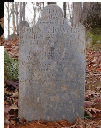
John Howser's stone after cleaning to allow easy reading of the 176 year old inscription