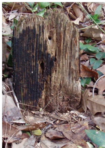
Typical wood headboard from the early 20th century suffering from weathering, decay, and even fire.

An excellent report on this topic can be downloaded from www.ncptt.nps.gov/wooden-artifacts-in-cemeteries-a-reference-manual-2007-10/