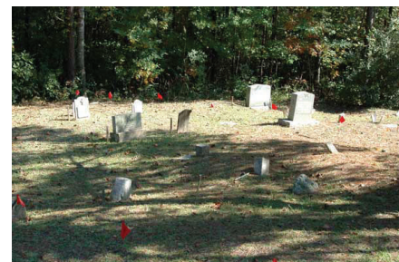
An overview of the cemetery shows the undulating topography typical of unmarked graves

The investigations found the cemetery to be filled, while also noting a range of traditional African American mortuary practices, including the use of concrete markers, vault tops, and individual grave borders.