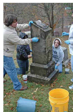
Participants cleaning stones and learning how to reset a tab-in-socket stone

Contact us to learn how your organization can sponsor a Chicora workshop!